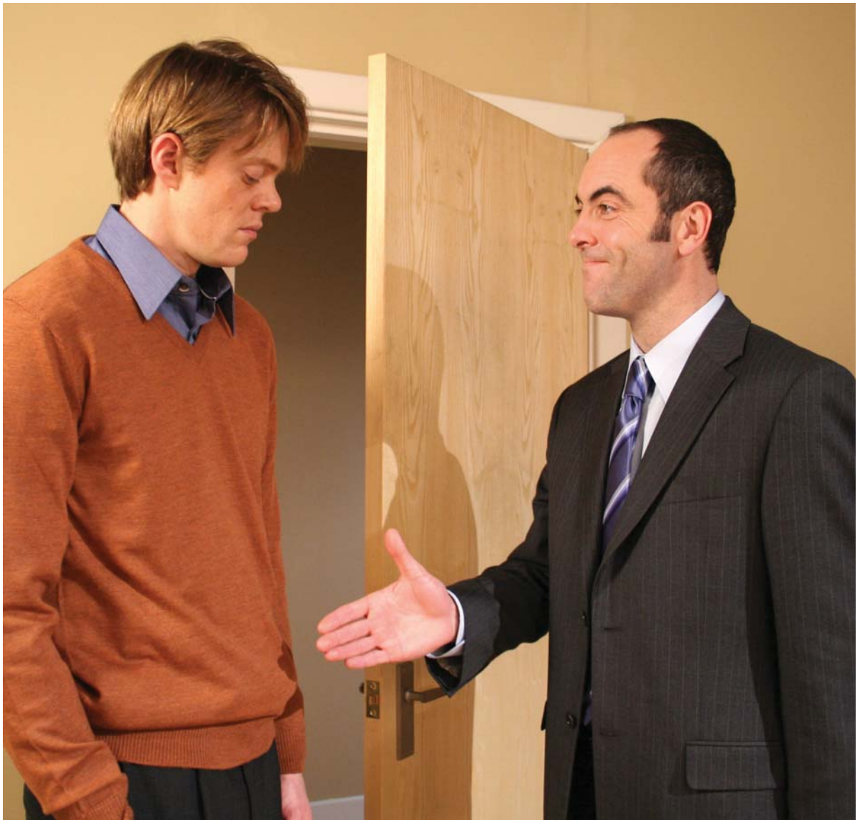
It is embarrassing for both parties when the recently selected candidate is not right for the job.